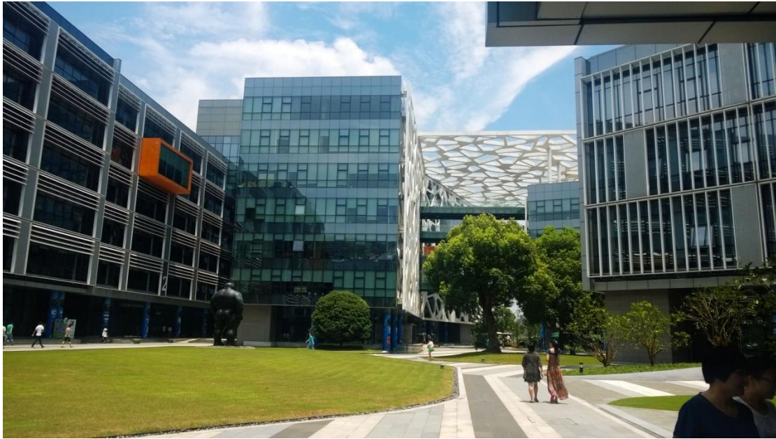
Alibaba's Binjiang Campus in Hangzhou, headquarters for Alibaba's B2B service