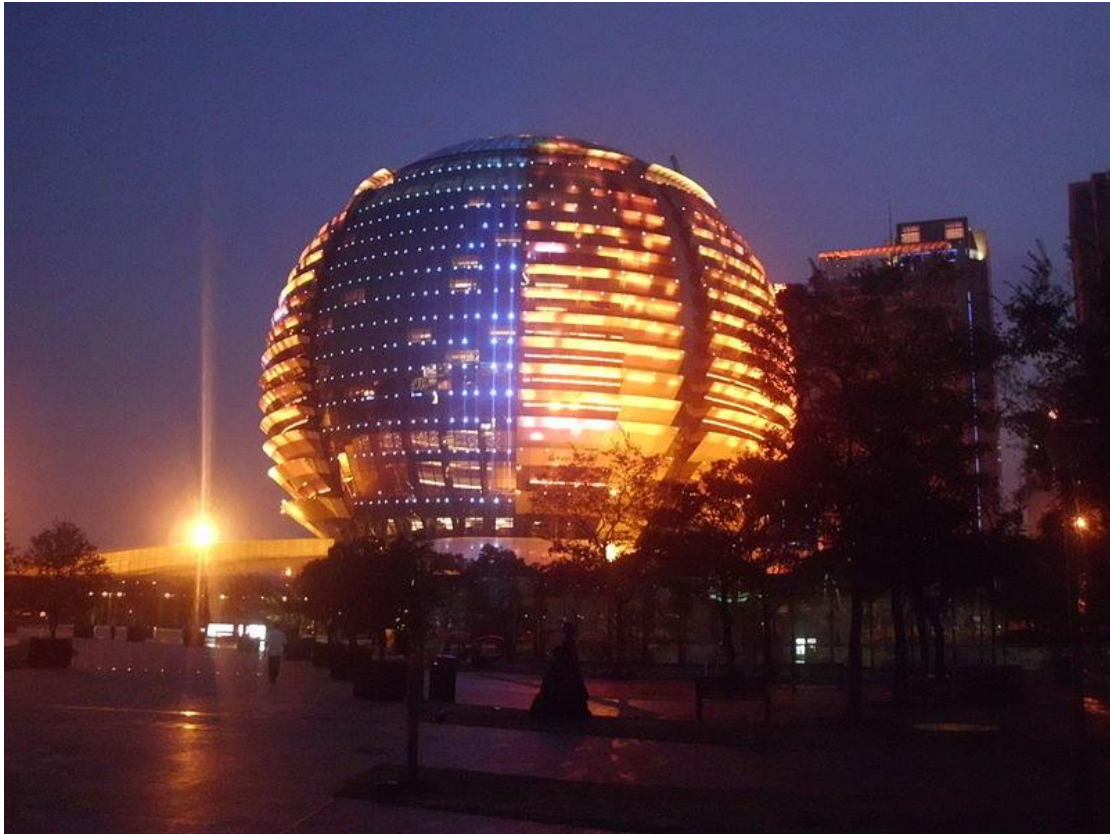
Hangzhou International conference center