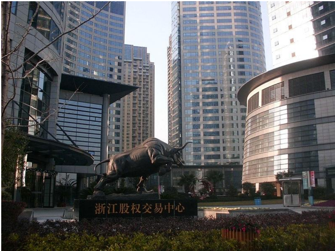
Qianjiang guoji shidai plaza